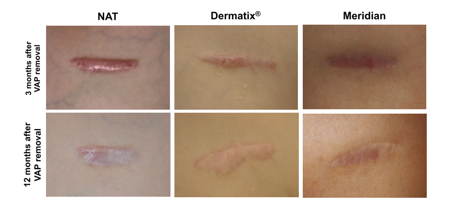
Fig. 2 Scar evaluations at 3 and 12 months after VAP removal. Scar recovery at 3 and 12 months after removal of the VAP is shown for three patients, each representing a different treatment option; natural scar healing, Dermatix®, and MCT. All patients agreed upon using their scar photographs

To translate these outcomes to daily care, a larger study is needed to confirm these findings. More patients should be included, and follow-up time should be increased to ensure